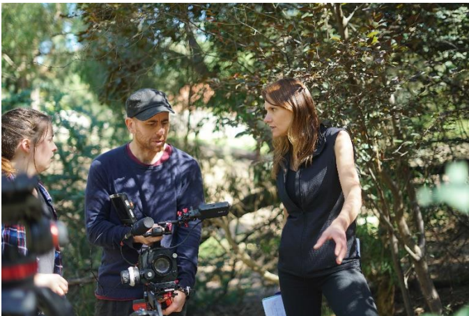
Director and DOP.